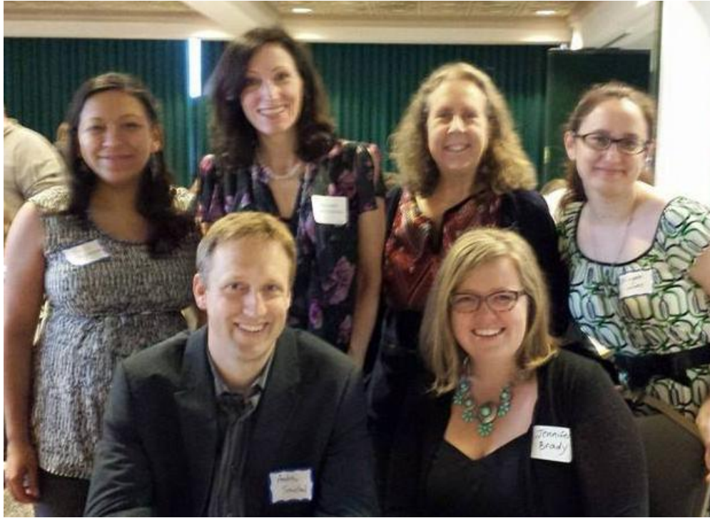
FLL'S SPANISH PROGRAMS FACULTY